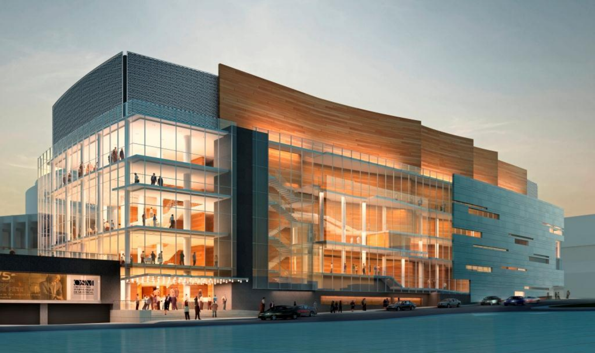
Montréal Concert Hall – Maison Symphonique, Québec