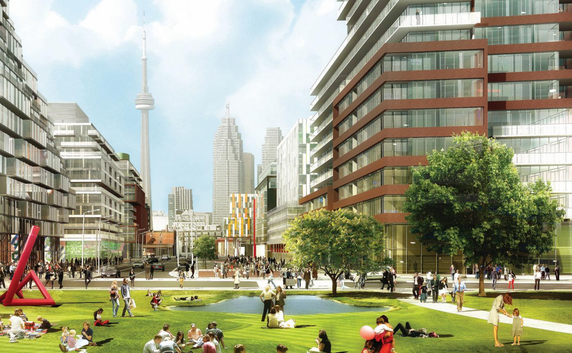
Pan Am Athletes' Village, Toronto, Ontario