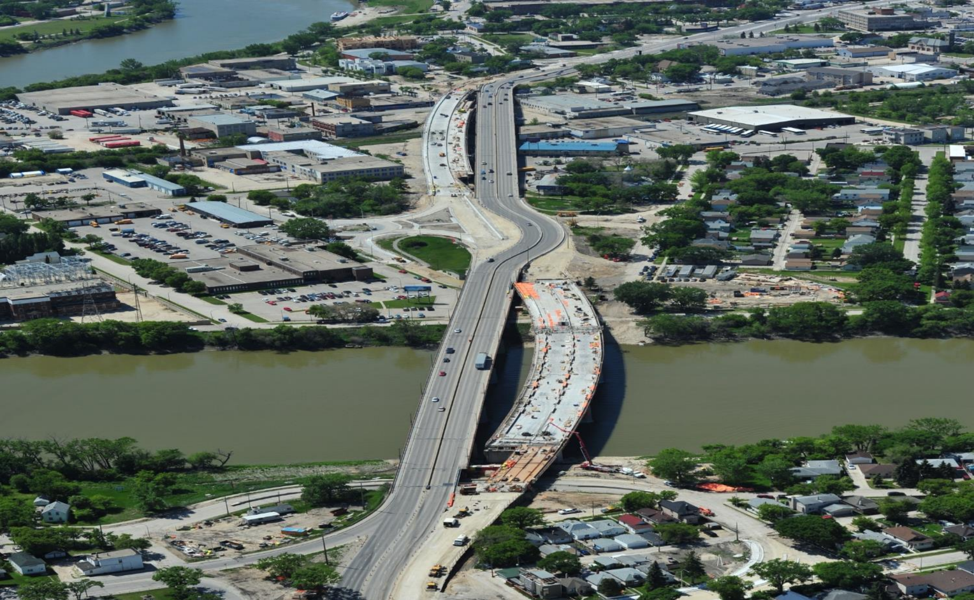
Disraeli Bridges, Winnipeg, Manitoba