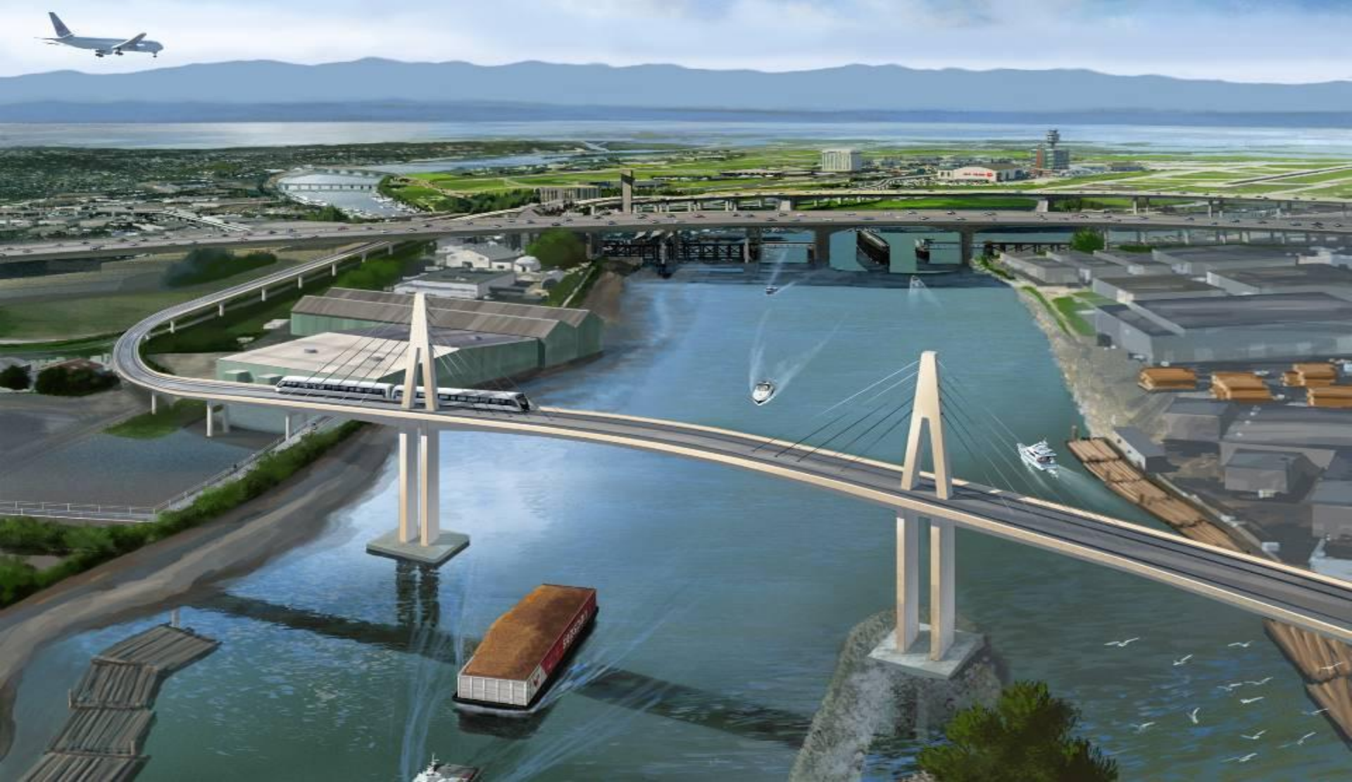
Canada Line, Vancouver, BC