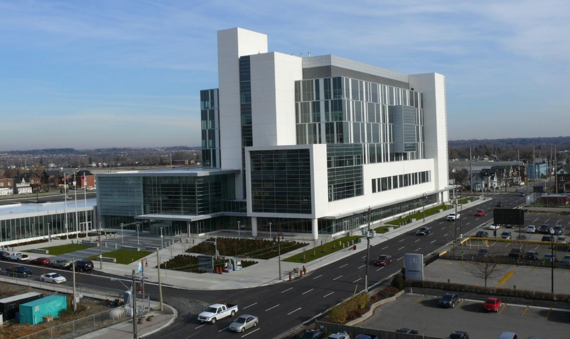
Durham Courthouse, Oshawa, Ontario