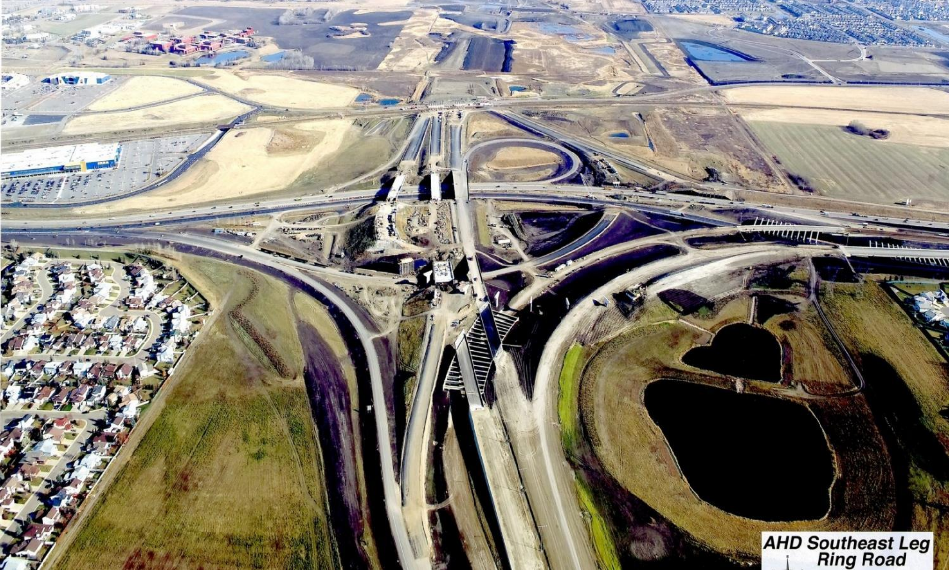
AHD Southeast Leg Ring Road