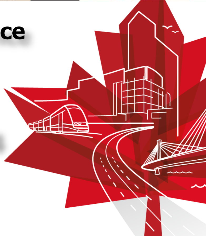
Canadian P3: Building the Global Standard