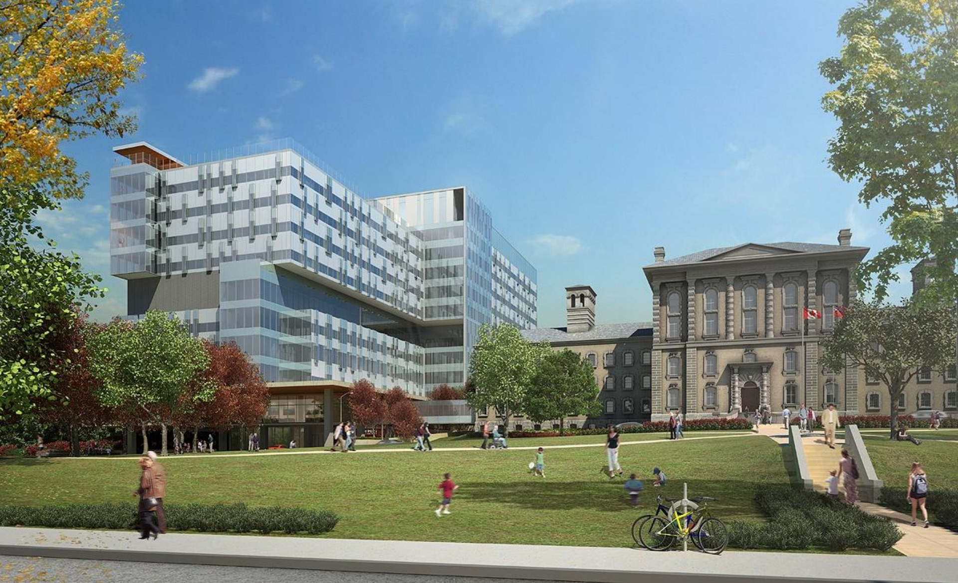
Bridgepoint Health, Toronto, Ontario