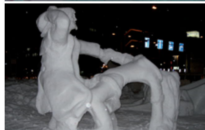
A nine cubic-metre block of snow transforms into a pair of "Klondike Dancers."